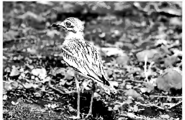
Indian Stone-curlew Burhinus indicus Stone-curlews are resident species here; they are most active during dawn and dusk and spend most of the day in the shadows of scrub vegetation.